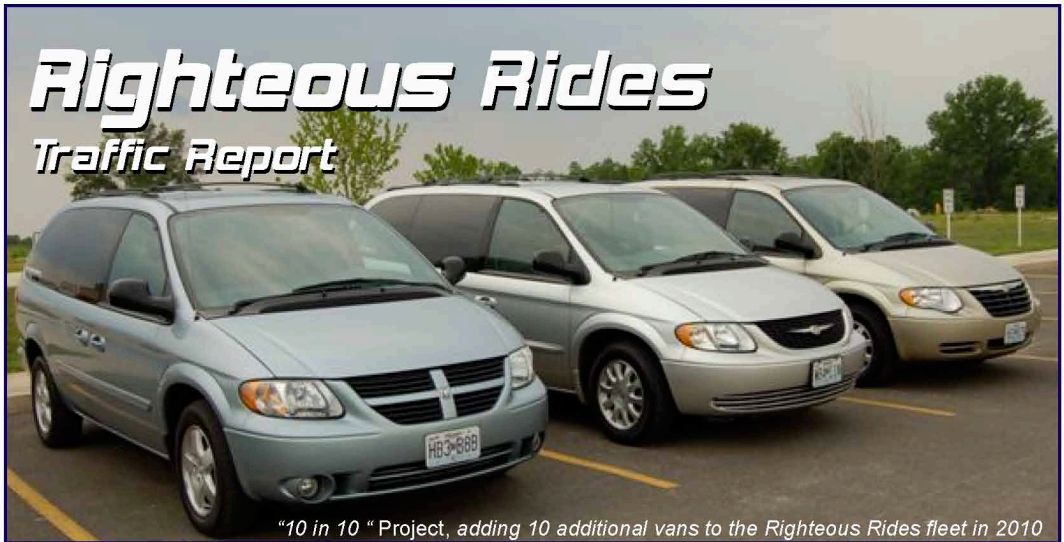
"10 in 10" Project, adding 10 additional vans to the Righteous Rides fleet in 2010